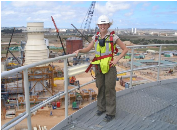
Gas Turbine Package for dual fuel operation with stack